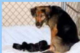
Ellie and her 6 puppies born at ARF, 6/20/10 ☺